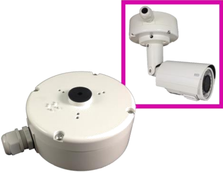
YUK-D06 Junction Box (option)